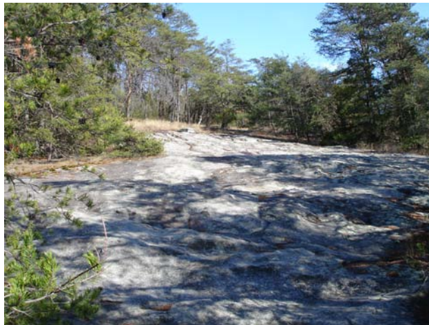
Granite Rock Outcrop

Rocky Face is a dome shaped mass of granite gneiss with a maximum elevation of 1795 feet above sea level. There are actually two summits on the mountain separated by a ridge and saddle. The summit is approximately 600 feet above the surrounding terrain. The terrain is steep and rocky and overall outline of the mountain lies in a northeast to southwest orientation with long sloping steep slopes on each end. The north face is steeper and more vegetated while the south face has seen quarry activity.