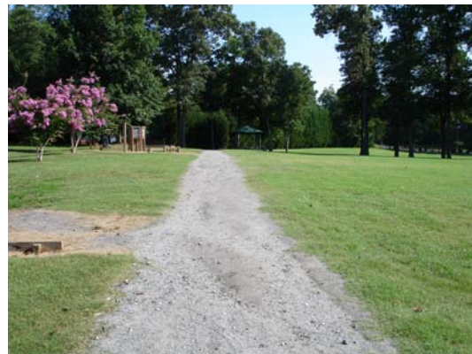
Matheson Park Walking Trail

In 2000, the County began developing Dusty Ridge Park in the southern end of the county. This park is located in the southern end of the county where the greatest increase in population has occurred over the last 10 years. Even though there are numerous ballfields and other active recreation activities at the park, a 1 mile nature trail was created in 2001. The Barry Holler trail loops around the perimeter of the park and is a natural surface trail.