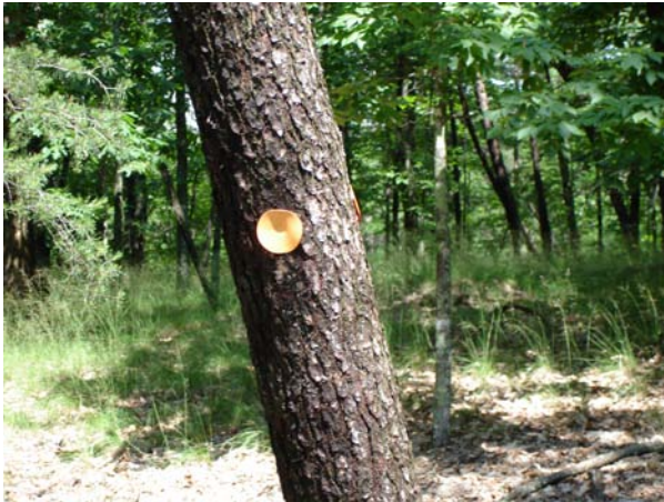
Trail Marker Stone Mtn. State Park

Because of damage caused by 4-wheelers at the trail head located off Rocky Face Church Road, it is recommended that during the first phase, the trail head be established at the area adjacent to Rocky Face Baptist Church. There is an unmarked footpath that currently connects to the main trail from the property next to the church. In a future phase, a connecting trail head would be established at the old quarry site.