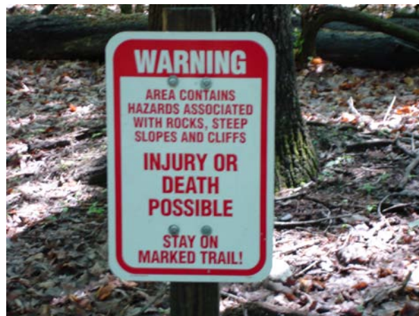
Safety Sign Stone Mtn. State Park

In addition to limiting access to certain areas for safety reasons, access needs to be limited to protect the fragile ecosystem of the rock outcrops. This can be accomplished with signage and fencing. In some areas, it may be possible to build a raised fenced platform along the outcrops. However, these are very expensive and they would have to be limited to certain areas. These platforms should be built with composite materials that will not deteriorate and be easy to maintain.