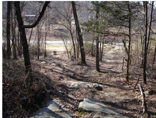
Existing Entrance used by 4-wheelers

County emergency personnel would have access to the lock on the gate for emergency situations. During the next phase with the development of old quarry site area an additional trailhead will be created and this will allow an additional access for emergency personnel.