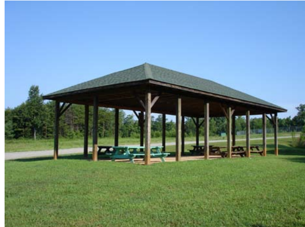
Dusty Ridge Park Picnic Shelter

A picnic shelter would be constructed at the area adjacent to Rocky Face Baptist Church during the first phase. The 20' x 40' shelter would have a concrete floor along with 6 picnic tables. One of the six tables would need to be handicapped accessible. In addition, 3 charcoal outdoor grills will be at the shelter. The picnic shelter would be the only location where cooking or fires would be allowed in the park. Trash containers would also be available at the picnic shelter. Besides serving individuals and families wanting to use the shelter, it could be used for groups and for small outdoor educational programs.