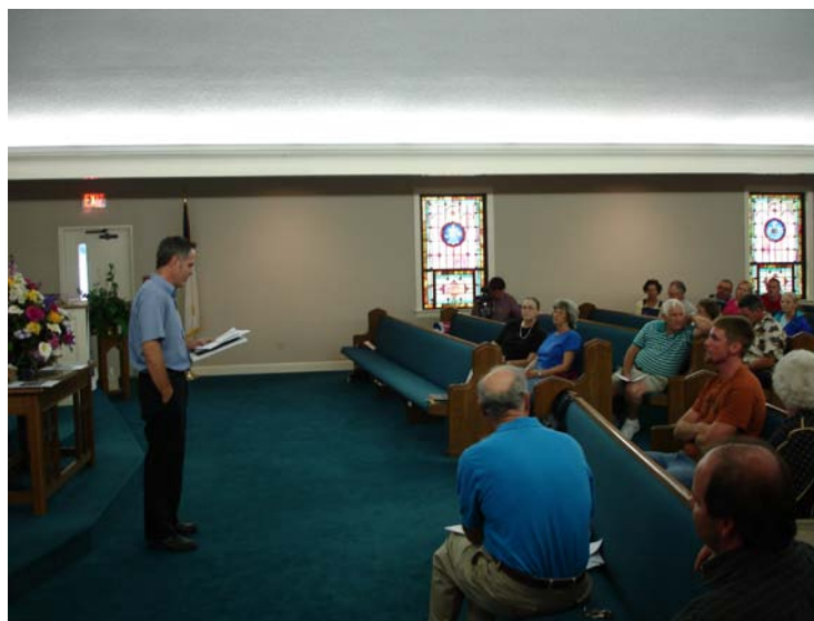
Rocky Face Community Meeting

The County conducted a public meeting on July 9 at Rocky Face Baptist Church. Citizens that attended the meeting expressed concerns about issues ranging from park security to noise created from a proposed stage. Many residents hoped that the rich history of the area would be brought out at the park. It was the consensus of the residents that they wanted to see a small passive park that would be consistent with the current restrictions for use from the Felburn Foundation and the North Carolina Natural Heritage Program. A summary of the comments received from citizens can be seen on the following page.