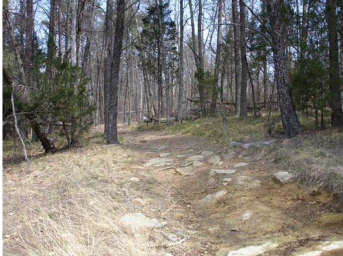
Existing Trail Rocky Face Mountain

Where it is possible, the trail renovation and construction should strive to make the trail sustainable. Following this concept could cost more initially, but there would be less maintenance required in the long run. Because of the environmental restrictions on the property, it would be hard to follow contours that are part of the sustainable trail concept without a lot of new construction for switchbacks.