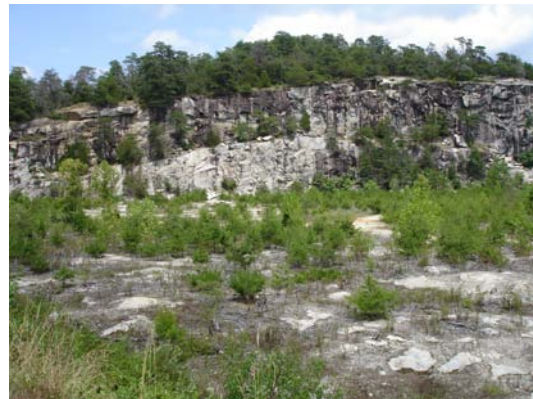
Old Quarry Site

As part of the land transfer agreement, development constraints were put on the property that include the following: